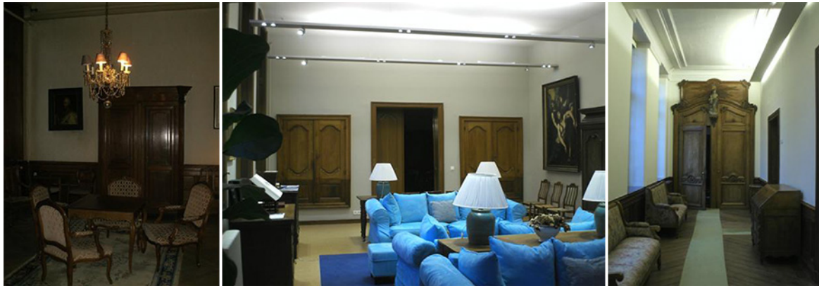
Figure 6. In the Dutch college, three different types of rooms can be distinguished in terms of lighting.

The amount of light and especially the kind of light also seemed to play an important part in the appreciation of the Dutch college. Based on their visit with an autistic participant (UE20), two architecture students distinguished three different types of rooms in terms of lighting (see Figure 6). The first type included rooms with authentic interiors (e.g., the salons and the library), each illuminated by an old crystal chandelier—a single direct light source which reflected the light multiple times. These reflections and the glimmering might result in an overload of stimuli. In the second type of rooms (the garden room and the canteen), the lighting was better for the user/expert because different ways of illuminating the room were available. These rooms had different contemporary light sources that each could function separately: indirect light, direct light, and spots. By choosing the desired amount and position of artificial light, a different atmosphere could be created in the room. Several ways of lighting were possible also in the chapel, but here the luminaires were of an older type. The third type of lighting was found in the hallways, which are illuminated indirectly. This offered enough light without too many stimuli.