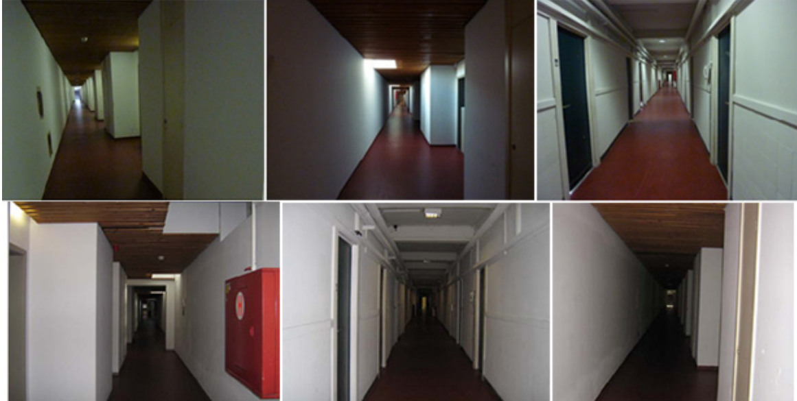
Figure 4. In the Popecollege, several user/experts complain about the lack of light.

An autistic participant (UE11) also mentioned the lack of sufficient natural light in the Popecollege, which he considered especially problematic in the long windowless corridors along the student rooms. Deprived of contact with outside, he did not know on which side of the building he was. Interestingly, the only corridor he found beautiful had sufficient light (Figure 5). This enabled him to better see how the space was finished. Another space he found beautiful was the hall with the old staircase. The hall was well-lit and spacious, and the rustic wood offered a beautiful contrast with the white painted walls.