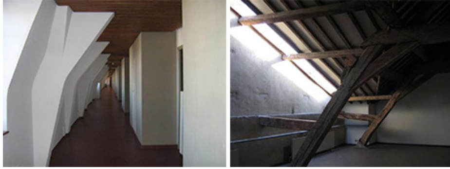
Figure 5. In the Popecollege, UE11 found one corridor beautiful: material finishes were similar to the other corridors, but more natural light entered the corridor.

The amount of light and especially the kind of light also seemed to play an important part in the appreciation of the Dutch college. Based on their visit with an autistic participant (UE20), two architecture students distinguished three different types of rooms in terms of lighting (see Figure 6). The first type included rooms with authentic interiors (e.g., the salons and the library), each illuminated by an old crystal chandelier—a single direct light source which reflected the light multiple times. These reflections and the glimmering might result in an overload of stimuli. In the second type of rooms (the garden room and the canteen), the lighting was better for the user/expert because different ways of illuminating the room were available. These rooms had different contemporary light sources that each could function separately: indirect light, direct light, and spots. By choosing the desired amount and position of artificial light, a different atmosphere could be created in the room. Several ways of lighting were possible also in the chapel, but here the luminaires were of an older type. The third type of lighting was found in the hallways, which are illuminated indirectly. This offered enough light without too many stimuli.