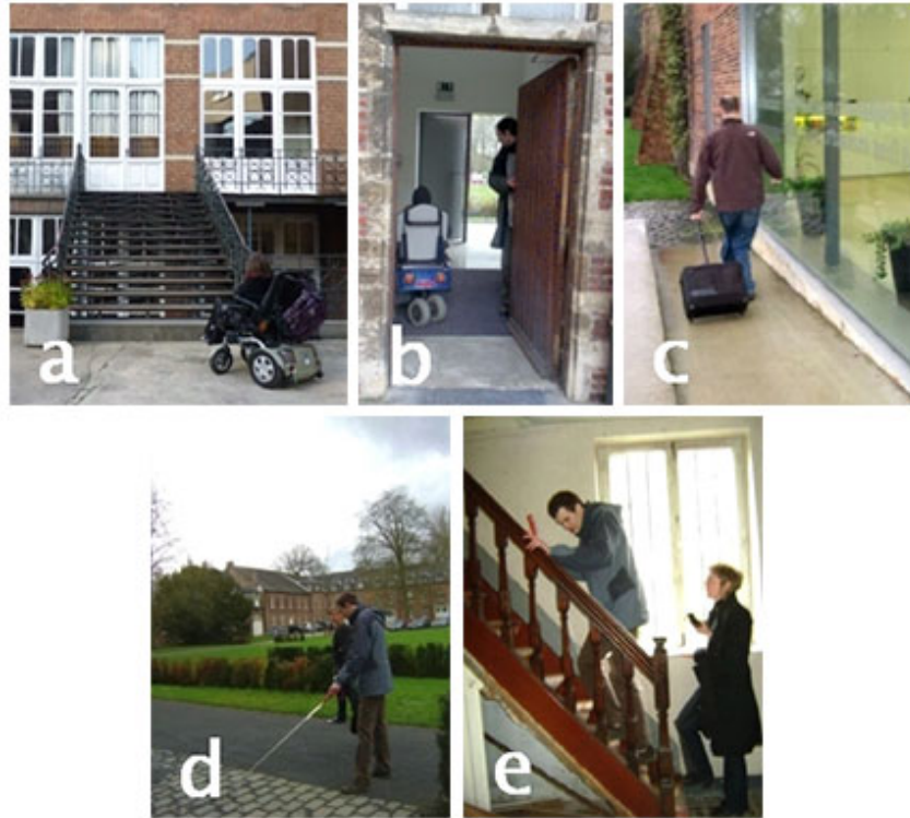
Figure 3. Gradient in obstacles: