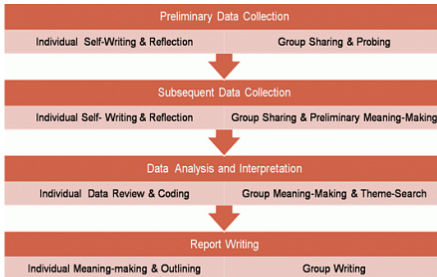
Figure 2. Collaborative autoethnography--a concurrent collaboration model.

In our own work, we have adopted a full concurrent collaboration model in which we collaborated at all stages of research--data collection, analysis, and writing. This model of full and concurrent collaboration could be logistically challenging because the research team needs to converge frequently to make collective decisions along the research process. Taking advantage of the physical proximity as colleagues at the same university, we set out to explore our common experiences as immigrant women of color in US higher education. We further characterize our collaborative autoethnography as dialogical and ethnographic. The collaboration process was dialogical because our independent self-exploration and collective interaction were interlaced in the process. Figure 2 provides a visual representation of this model.