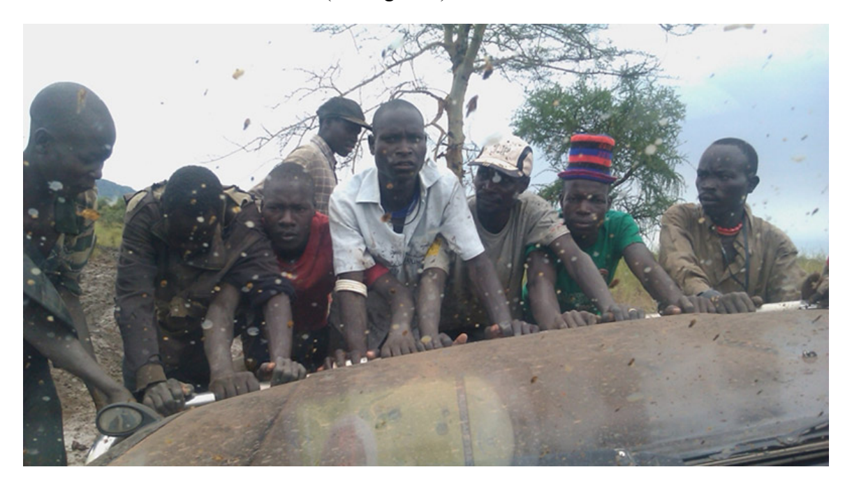
Figure 1 . Field data collection teams faced transportation challenges. (Field teams were assisted by helpful local people in bad weather and bad road conditions.)

Makerere requested bids from several companies to provide drivers and vehicles for the six teams. We selected two companies, assigning three teams to each. Our team personnel were required to pay for petrol along the way, providing another accounting and cash flow challenge. In one region, it was necessary to hire security personnel from the Ugandan police force to accompany data collectors. Heavy rains made roads slippery, mud was deep, and some roads were washed out (see Figure 1).